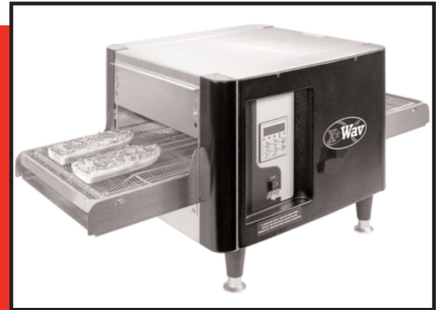
X*WAV™ 1422 EZ SS PASS THROUGH CONVEYOR TOASTER